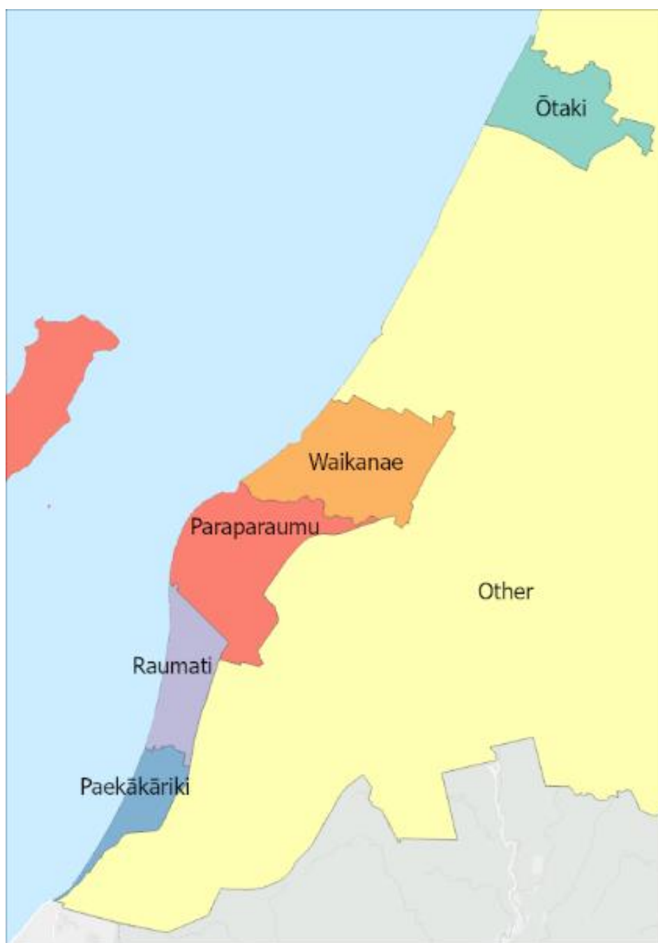
Figure 1. Map of the six housing areas used for analysis of residential development capacity

Table 3 sets out the short, medium and long-term demand for dwellings by type and housing area. Note – analysis within this assessment uses rounding in its breakdown of housing demand across housing areas and housing types. This accounts for slight differences in subtotals and totals when aggregated in this report and when compared to supporting assessment work.