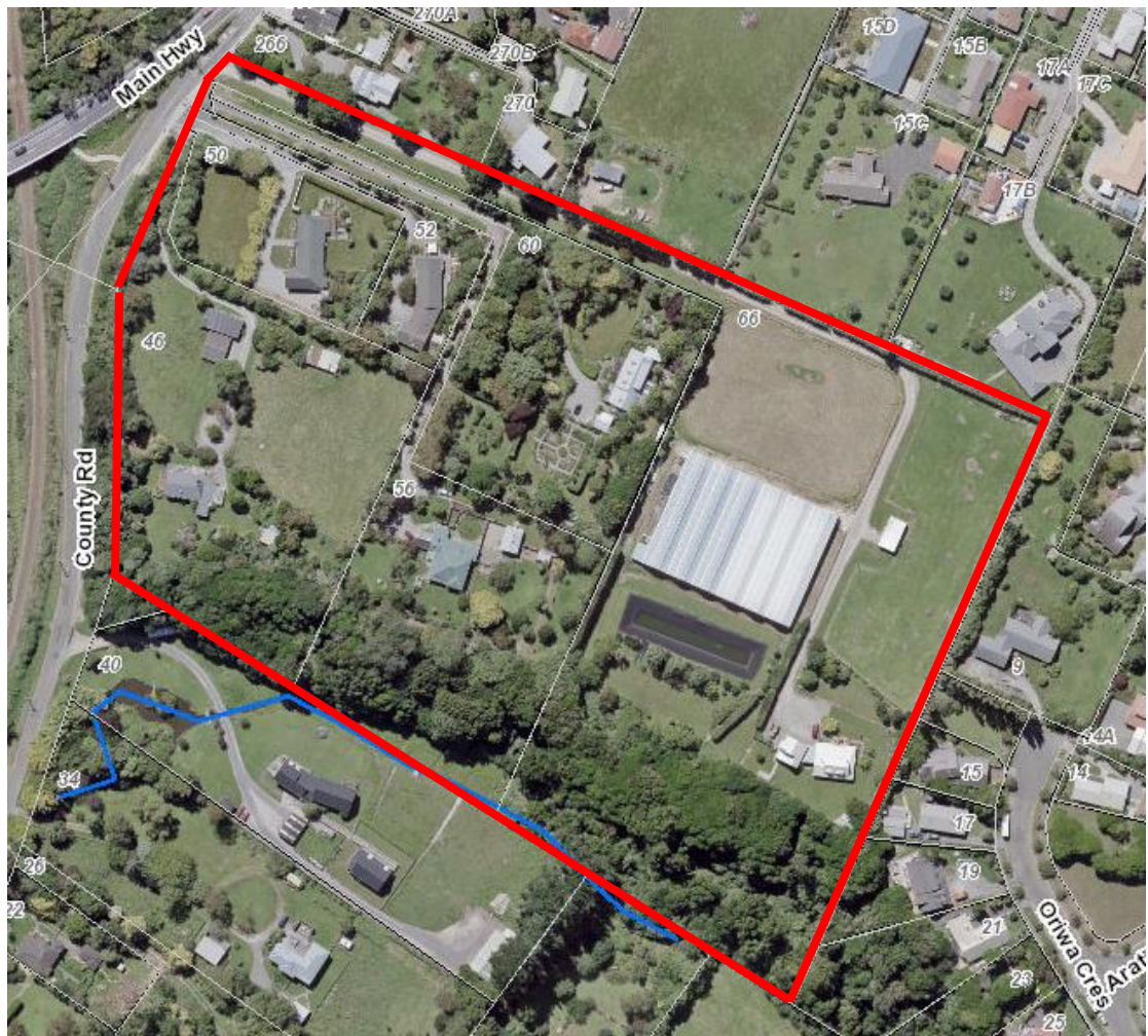
Figure 1: Extent of the County Road Ōtaki Low Density Precinct