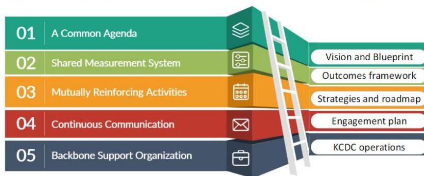
Diagram 1: key steps in collective impact and direction setting