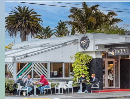
Travel to meet friends