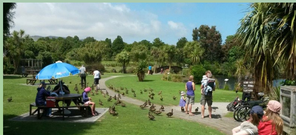
Travel to local attractions