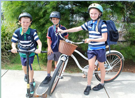
Travel to and from school