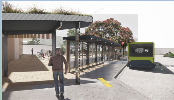
Travel to and from transport hubs