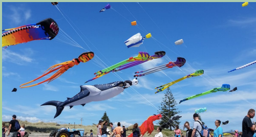
Travel to events