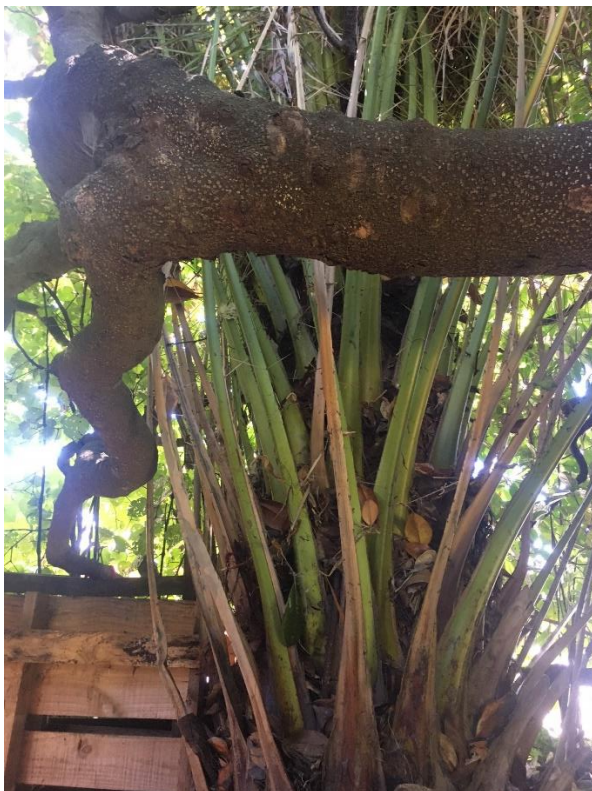
313 Reikorangi Road