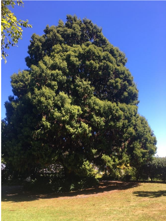
Phoenix palm growing through protected magnolia