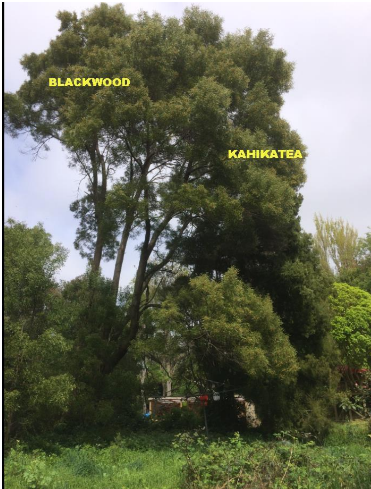
58 Hadfield Road, Peka Peka